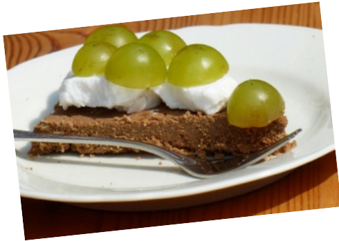
pie with coconut cream and grapes