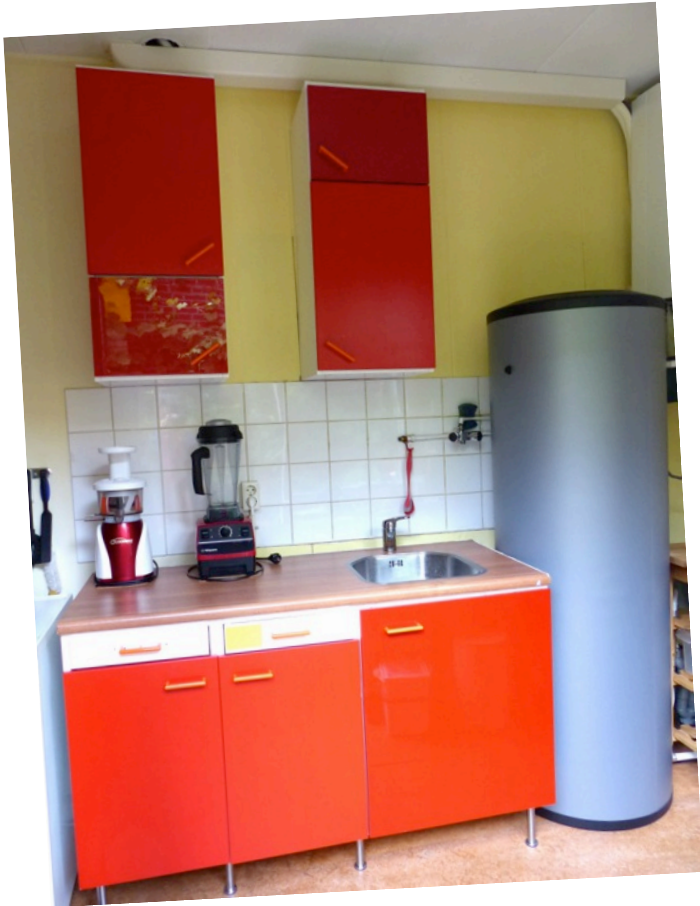
the air heat pump with the new kitchen

We heard passers-by say to each other: that planter is nice together with all those colours of the house!