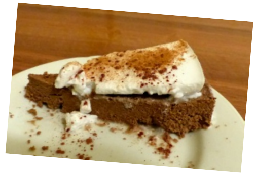
pie with coconut cream and cinnamon

biological grated coconut we buy it via the website of IDorganics 5 kilo for € 17,50 http://www.idorganics.com