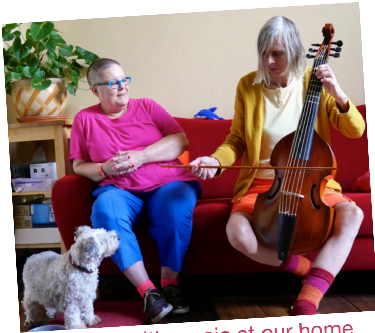
encounter with music at our home

We want to look whether it is possible to start our own social, musical, sustainable living project ideally in or close to Utrecht.