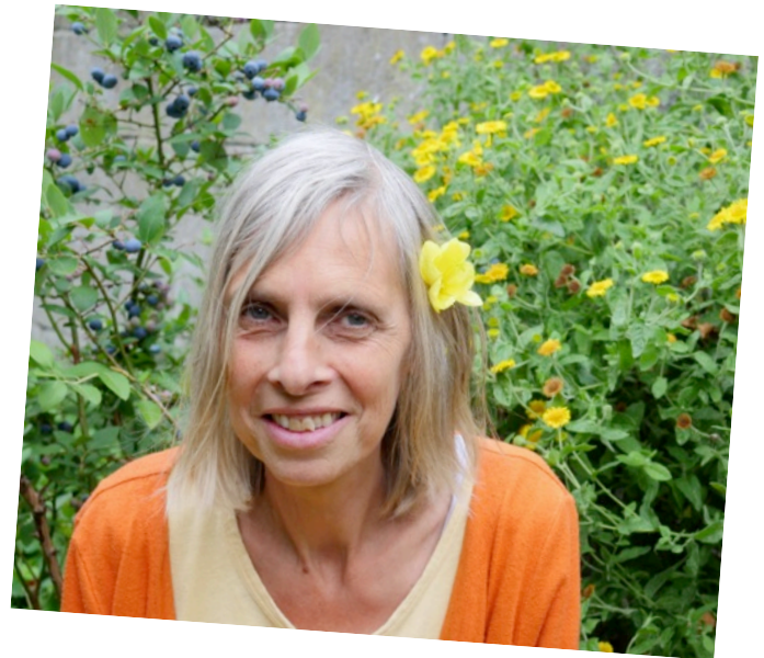
photo made in our garden made for the interview

Photos from the interview are on our weeklog (weekly news) http://www.contactmuziek.nl/weeklog.html